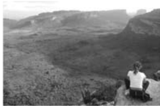
FIGURE 1: Location of the Chapada Diamantina and São Francisco Craton in the Brazilian territory. The photo illustrates one example of the local landscape.

These rocks are stratigraphically divided into four groups as follows: Rio dos Remedios Group (Paleoproterozoic), Paraguaçu and Chapada Diamantina Groups (Mesoproterozoic) and the Una Group (Neoproterozoic). The Rio dos Remédios and Paraguaçu groups were deposited inside an aborted rift valley and the Chapada Diamantina Group, as a sag basin. The set is shaped as a “bovine head” basin and exhibits nowadays an average thickness of more than 1.000 m. According to Dominguez (1993) the deposition of these rocks started 1,7 Ga. ago and lasted for around 700 million years (Pedreira, 1997).